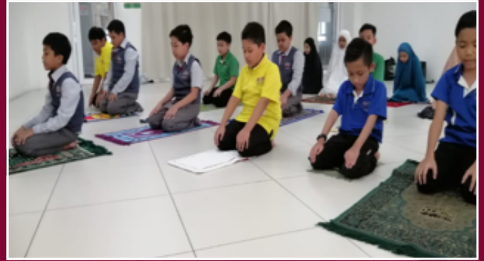
Practising Solat Zuhur in congregation.