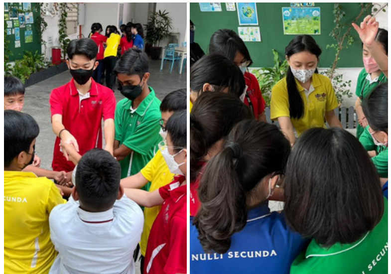
Prefectorial Board team building session for 2023.

We, from the MPS Pastoral Department, do hope and wish to see those currently on the board step up in aspects such as responsibility, vigilance and leadership. This could be achieved to reach a higher benchmark by looking at the positive and encouraging ambience of our current MPS students as a whole.