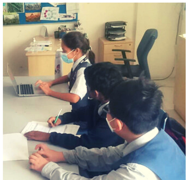
Student Council members brainstorming ideas for fundraising.

Outside fundraising, the council looks after the concerns of the students in MIS and tries to bring about positive change regarding these concerns. Small changes to the canteen, cleanliness of the school and safety of students have all come about through the good work of the Student Council. Members have delivered assembly presentations as well as all members are positive role models to their peers in the secondary school.