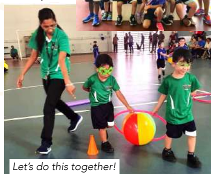
Let's do this together!