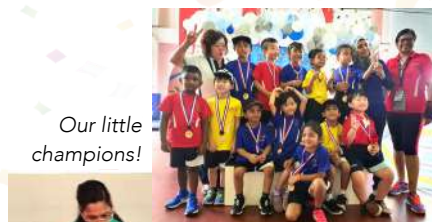
Our little champions!