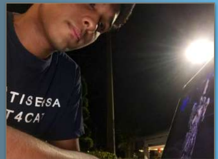
Soriaa took his laptop outside and watched the video under the moonlight for a change of scenery.

What this means is that education is not based on what needs to be done today or tomorrow, but it is also for your future and the days ahead of you.