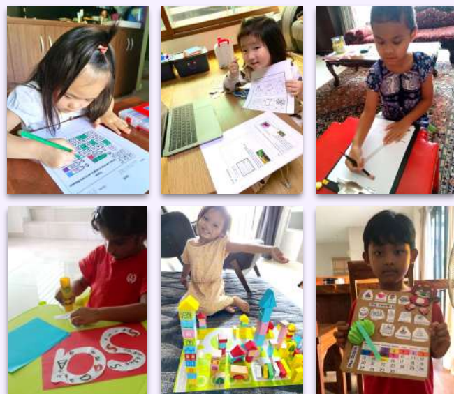
Off-screen learning with concrete materials suitable for preschoolers.