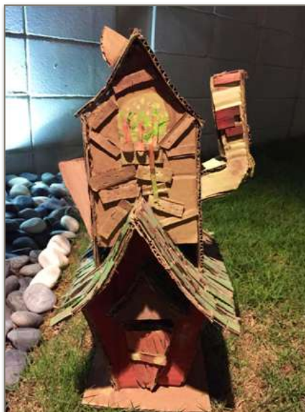
House model construction and design by Carol Lim, Standard 6