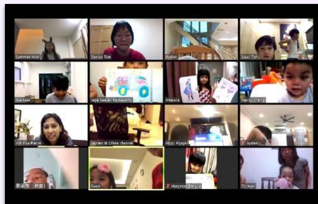
Face to face interactions with the children via video conferencing.

We will continue to support you by preparing interactive lessons and meeting up with your little ones as frequently as possible via video conferencing. We are counting the days to having them back in MGS - safe and healthy.