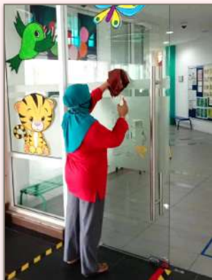
Sanitisation of all surfaces