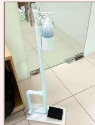
Foot Press Sanitiser placed around campus