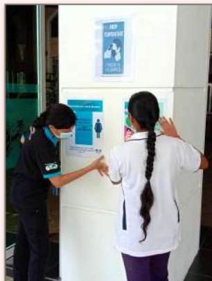
Putting up informational posters and reminders