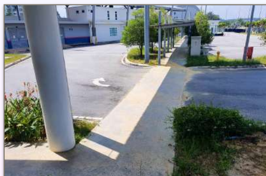
Designated area for MPS Secondary students' pickup which can be accessed from MPS LG parking area.

Note: These SOP are what we have put in place for the opening of school. In the course of implementing them, they may be adjusted and amended to make them more practicable for our students, staff and parents.