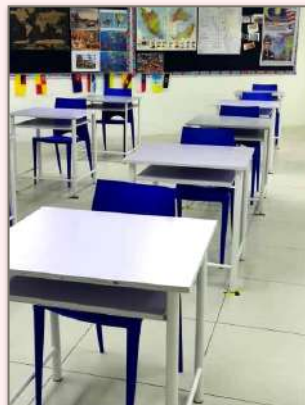
Distanced class seating arrangement