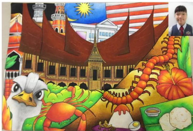
2nd place: Tan Ee Va, Form 2M