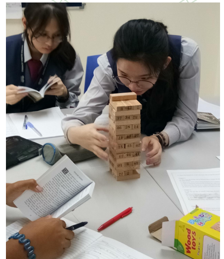
Playing the DMK Jenga game