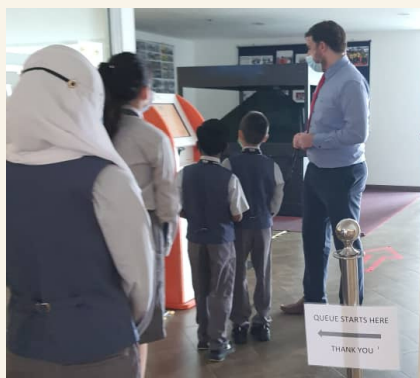
School tour, canteen credit top-up kiosk