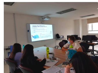
Global Perspective class