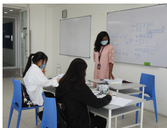
A Chemistry lesson in progress