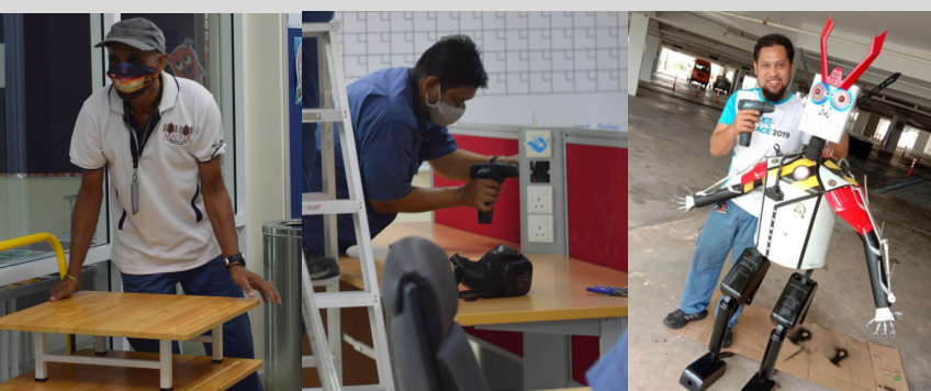
Our facility team busy with fixing and creating new things