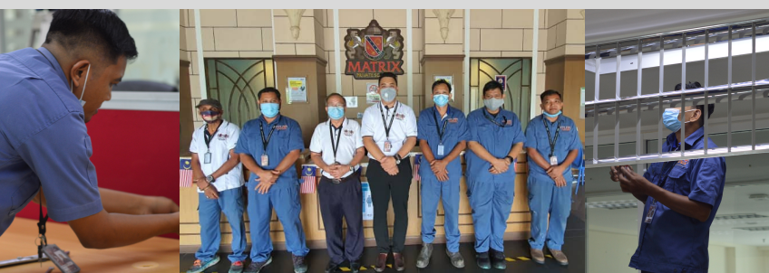
Facilities Team, regular maintenance and fixing the air conditioners and wiring

A big thank you to them for their dedication and care for the school.