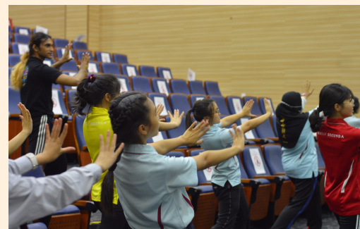
Warm up exercise

Our students are excited about the much awaited production and have given an overwhelming response to the auditions. We wish them luck in doing their best to be selected!