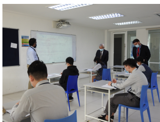
Further Mathematics class