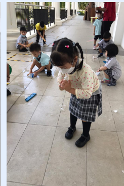
Yeay! Finally, the toy is rescued!