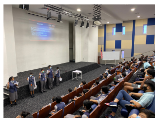
Signing the pledge, swearing in and receiving new ties