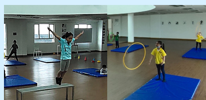
Jumping, Year 3