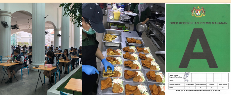
Clean eating and food preparation areas