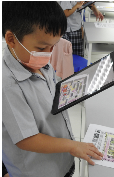
Augmented Reality activity

Parents are introduced to the academic team and the curriculum while their child is brought into the classroom for a taster session of their new classes. The next step in their learning experience is always exciting and we cannot wait to see the Early Years students in the "Big School"!