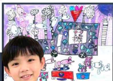
Kingsley Toh Jyun Chi 8 years old Ice Cream Truck