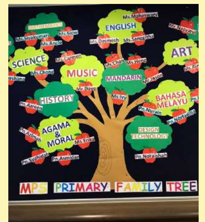
Wonderfully decorated classrooms and corridors provide a conducive learning environment.