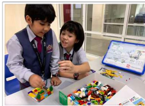
Lower Primary students will be guided to plan, design, code and build using LEGO Education WeDo 2.0 system with the aim to qualify for the First LEGO League Jr. Challenge.