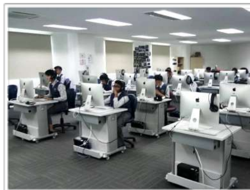
Well equipped ICT labs utilising different operating systems (Windows, Apple, Google) to prepare students for any digital environment in the future.

It is our hope that by giving our students ample opportunities to explore technology, either by learning a programming language in depth or through a digital creative effort by producing a short animation or even just producing a document using the iPad, MGS students will be better equipped to cope with a world of rapid change in technology, increasing interconnectedness, and new forms of employment.