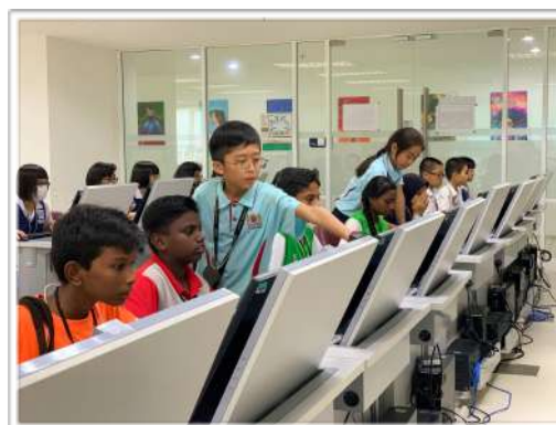
MGS will be actively promoting STEM-related learning activities not just for our students, but also for the community.