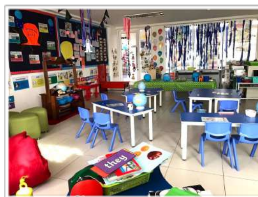
Vibrant, colourful displays showing students' learning makes an exciting environment in Matrix Global Schools.