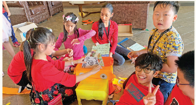
Year 5 and 6 constructed 3D dragon models, big enough for the students to put on to do a parade.

Preschoolers baked butter cookies during their Afternoon Extended Programme.