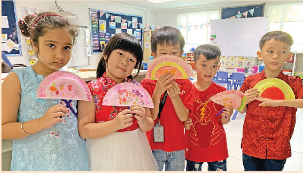
Traditional Hand Fans made using paper plates and craft sticks were happily created by the Key Stage 1 students.