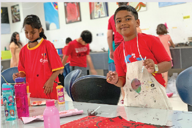
Year 3 and 4 made beautiful blossom trees using the blowing technique in the Primary Art Studio.