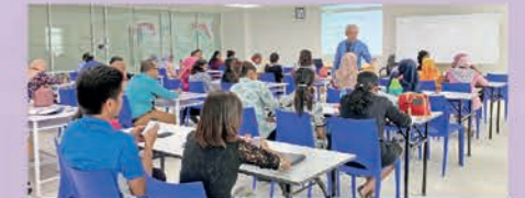
Continuous Professional Development session for teachers

The main thrust of the Transformation Team has been to make teaching and learning more effective in the school. To this end lesson observation have been regularly conducted to mentor teachers to be more effective in the delivery of their lessons in class.