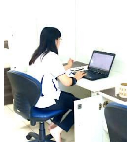
Tagging of Boarding House Assets