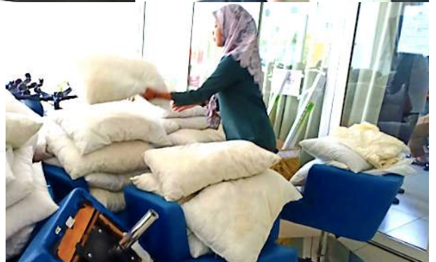
Tagging of Boarding House Assets